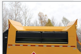
Wings plates extensions